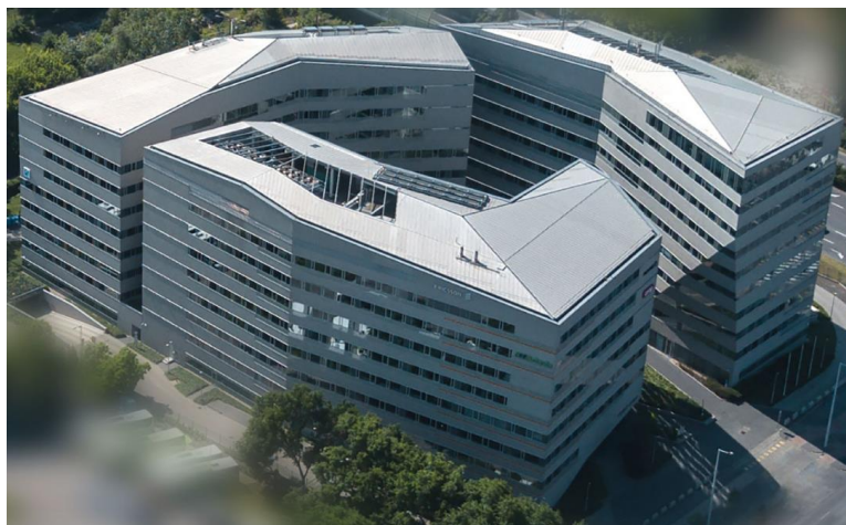
Bird's-eye view of the Népliget Center Office Building

Operator: White Star Real Estate Kft. (1124 Budapest, Csörsz utca 49-51.)